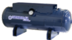
10 Gallon N2 Storage Tank