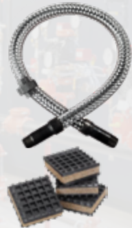
Includes 30" Stainless Steel Flex Hose & Union and Vibration Pads.

General Air Products High Pressure LT Plus Series are Lubricated, Single Phase, Tank Mounted Fire Protection Air Compressors that are designed to fill dry pipe and pre-action fire sprinkler systems to 40 PSI within 30 minutes per NFPA 13.