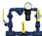
Part # AMD-1

The AMD-1 regulates the volume of air being delivered to the sprinkler system by the air compressor.