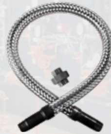
Includes Riser Mounting Bracket, 30" Stainless Steel Flex Hose & Union.

General Air Products newly improved OLT Plus Series Oil Less Riser Mount, Three Phase Fire Protection Air Compressors are specifically designed to fill dry pipe and pre-action fire sprinkler systems to Supervisory Pressure within 30 minutes per NFPA 13.